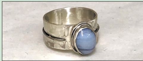
Artist: Conner L. Title: Olé Blue Ring